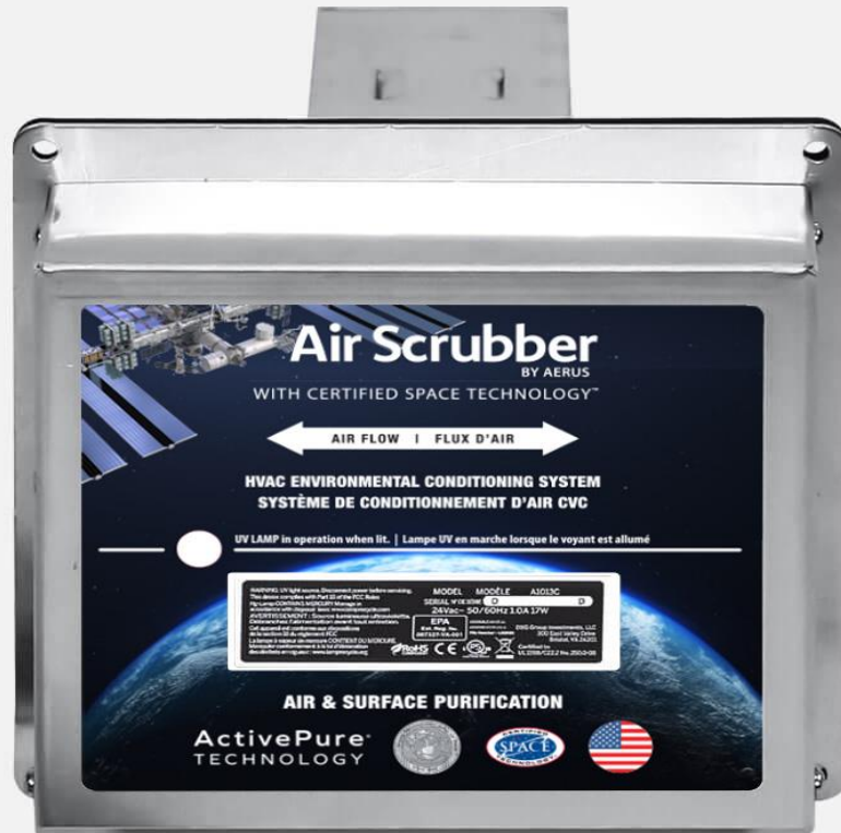
DUCT MOUNTED SYSTEM

The Air Scrubber by Aerus® attaches directly to the HVAC system ductwork to reduce viruses, bacteria, and other contaminants in the ambient air and on surfaces while the HVAC fan is running.